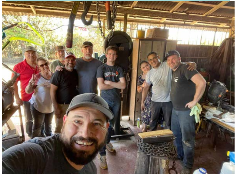
Picture of The Redeemed Steel Team in Costa Rica. More to come from here.