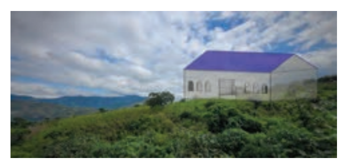
Photo of the actual location reserved for the Redeemed Steel Trade School in Guatemala with an Artist's Rendering of the School itself.

You can help us make this dream a reality by contributing to the vision and mission of Redeemed Steel. Thank you so much for partering with us in the great journey together.