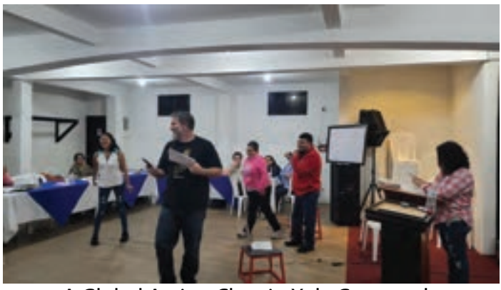
A Global Action Class in Xela Guatemala

In September we were able to help in the training of around 40 ministry leaders, teaching one class in Essential Biblical Doctrine and another is Ministry organization and church structure.